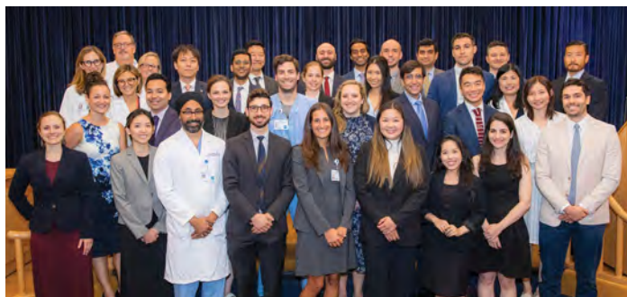
June 19, 2023