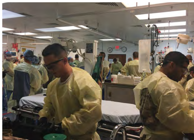
Getting prepared for trauma cases to arrive.

Hometown Heroes is an Alumni News series that celebrates the many HSS faculty and alumni who have served our country in the military.