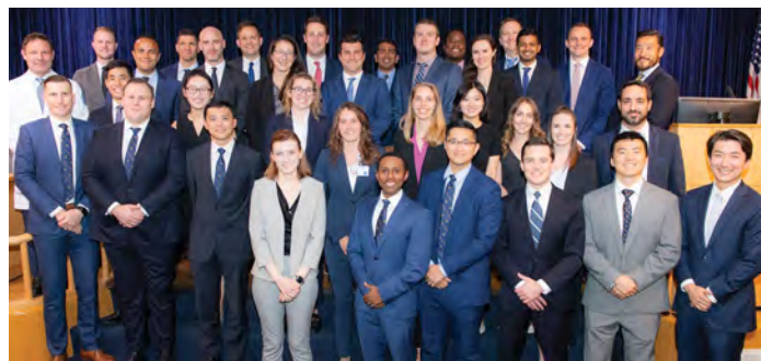
July 17, 2023