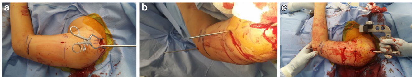
Fig. 2. a–c Intraoperative photos. a Entry point and while reaming the medulla. The 1-cm osteotomy wound is evident. b Proximal and distal pins to control the rotation. c Position while introducing the IM PRECICE nail.

has two modules: the disability/symptom section (5 subscales with 11 items, scored 0–100 points; the higher the score, the greater the disability) and the optional high performance Sport/Art or Work section (each scored 0–20 points). We did not include the optional modules as they were not related to our study and were not consistent with our patients' level of interest. The patients retrospectively answered the questions to report the functional status before and after humeral lengthening.