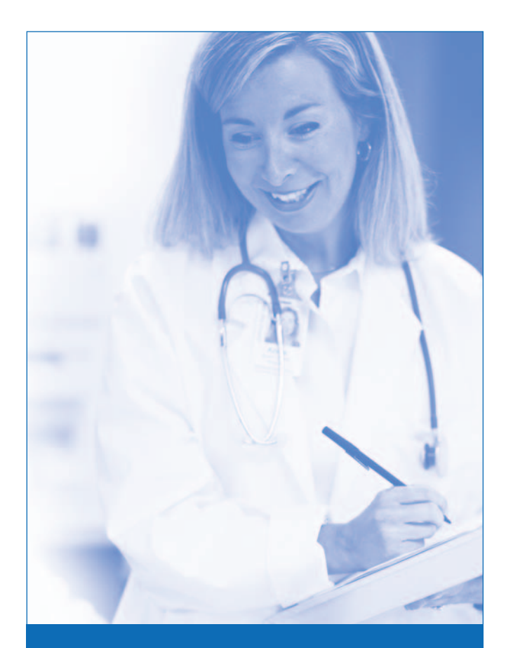
Regional anesthesia allows for greater comfort following surgery and a smooth transition with recovery.

In the recovery room your anesthesiologist and the recovery room team will monitor your safe transition from the effects of anesthesia and your readiness to go home.